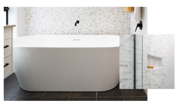
NOTE: Photographs are shown for illustrative purposes and may differ to products provided, including but not limited to colours, finishes and layout.