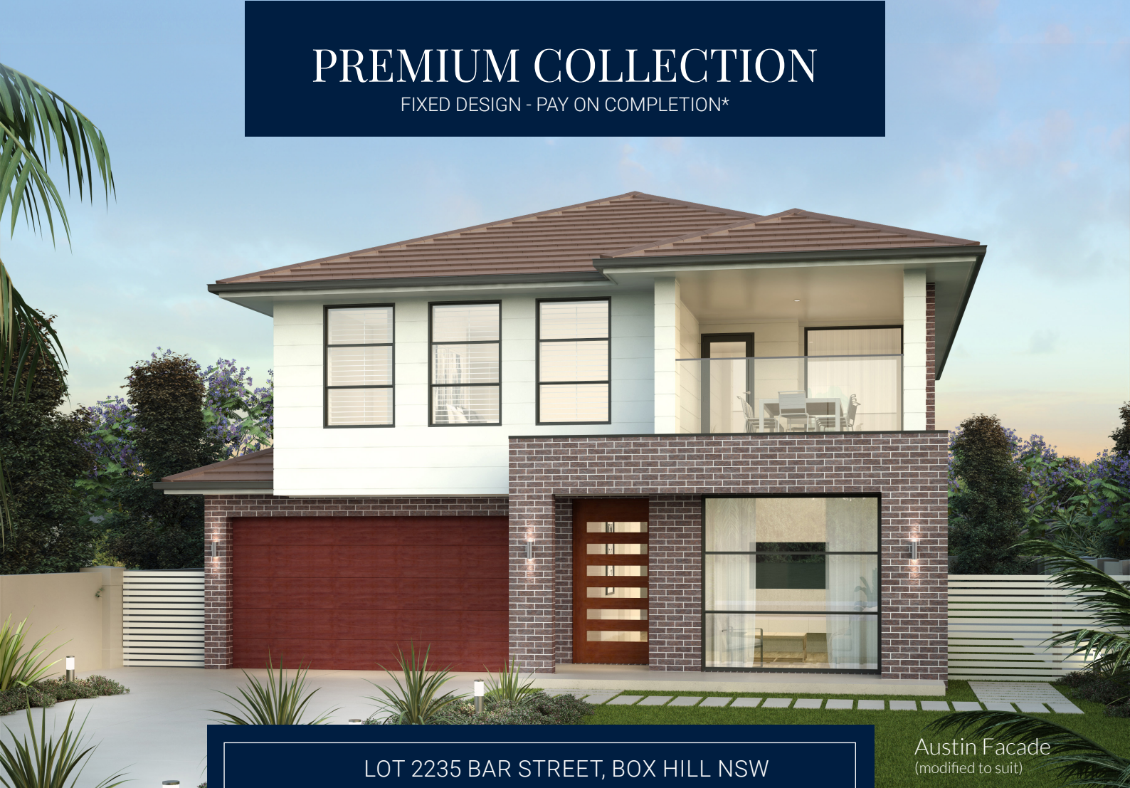
Austin Facade (modified to suit)