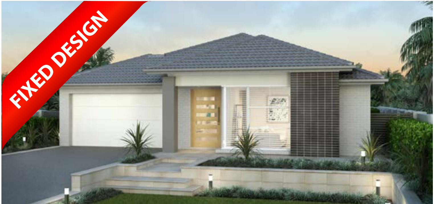
ARTIST IMPRESSION ONLY NOAH FAÇADE AS ILLUSTRATED.