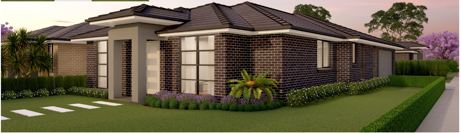
ARTIST IMPRESSION ONLY. ALTA CNR FAÇADE AS ILLUSTRATED.