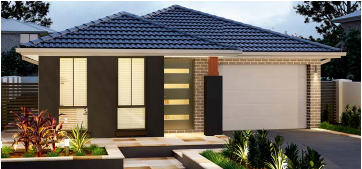
ARTIST IMPRESSION ONLY. CAPRI FAÇADE AS ILLUSTRATED.