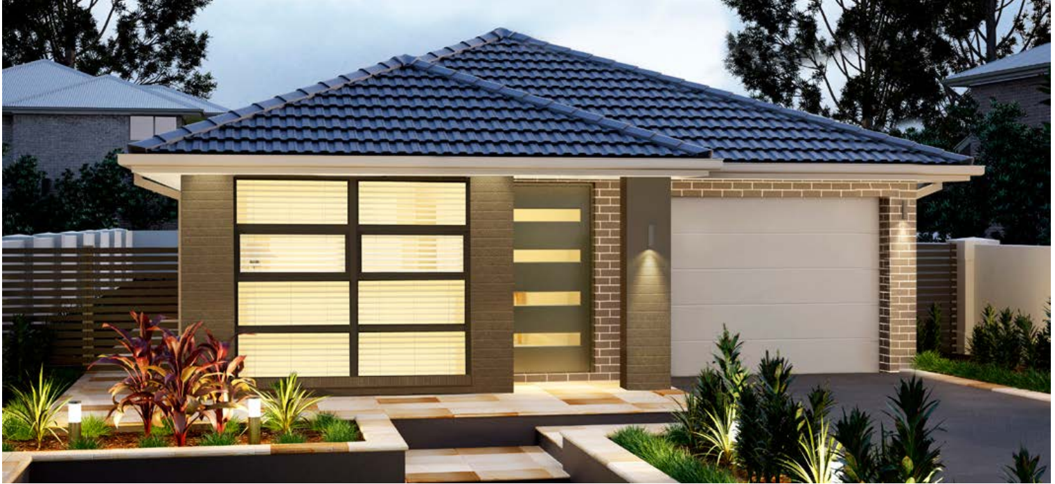
ARTIST IMPRESSION ONLY. DUNE FAÇADE AS ILLUSTRATED.