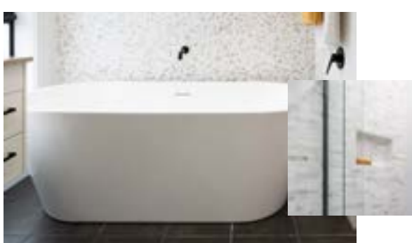
NOTE: Photographs are shown for illustrative purposes and may differ to products provided, including but not limited to colours, finishes and layout.