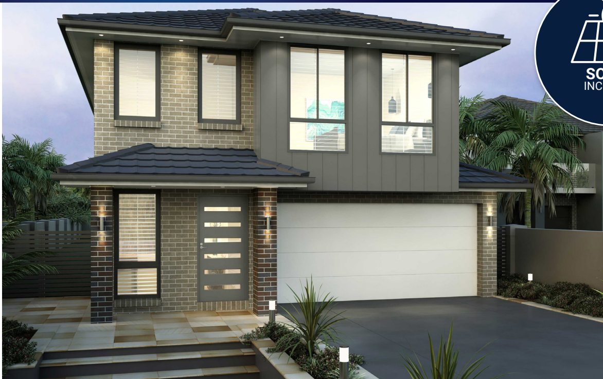
ARTIST IMPRESSION ONLY. CLASSIC FACADE AS ILLUSTRATED.