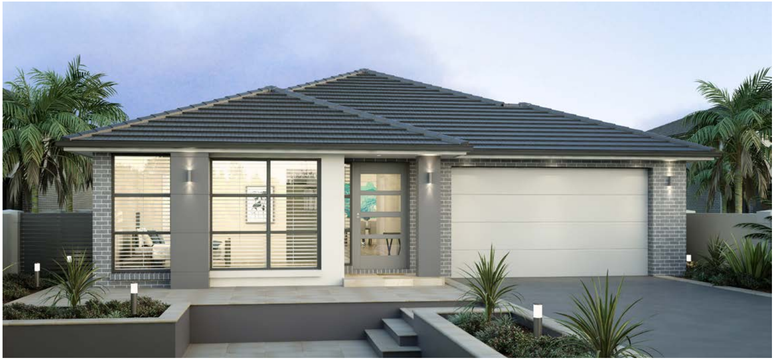
ARTIST IMPRESSION ONLY. BROOKLYN FAÇADE AS ILLUSTRATED.