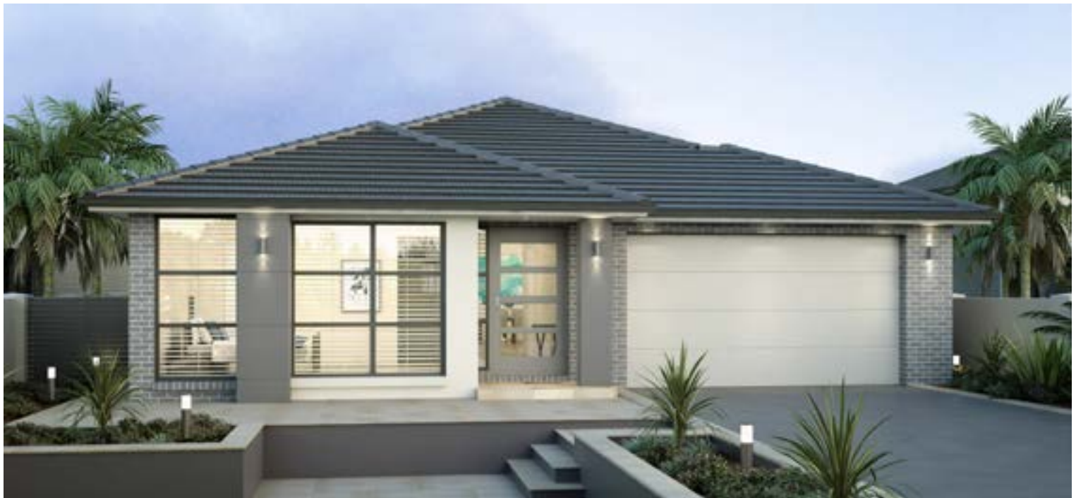
ARTIST IMPRESSION ONLY. BROOKLYN FAÇADE AS ILLUSTRATED.