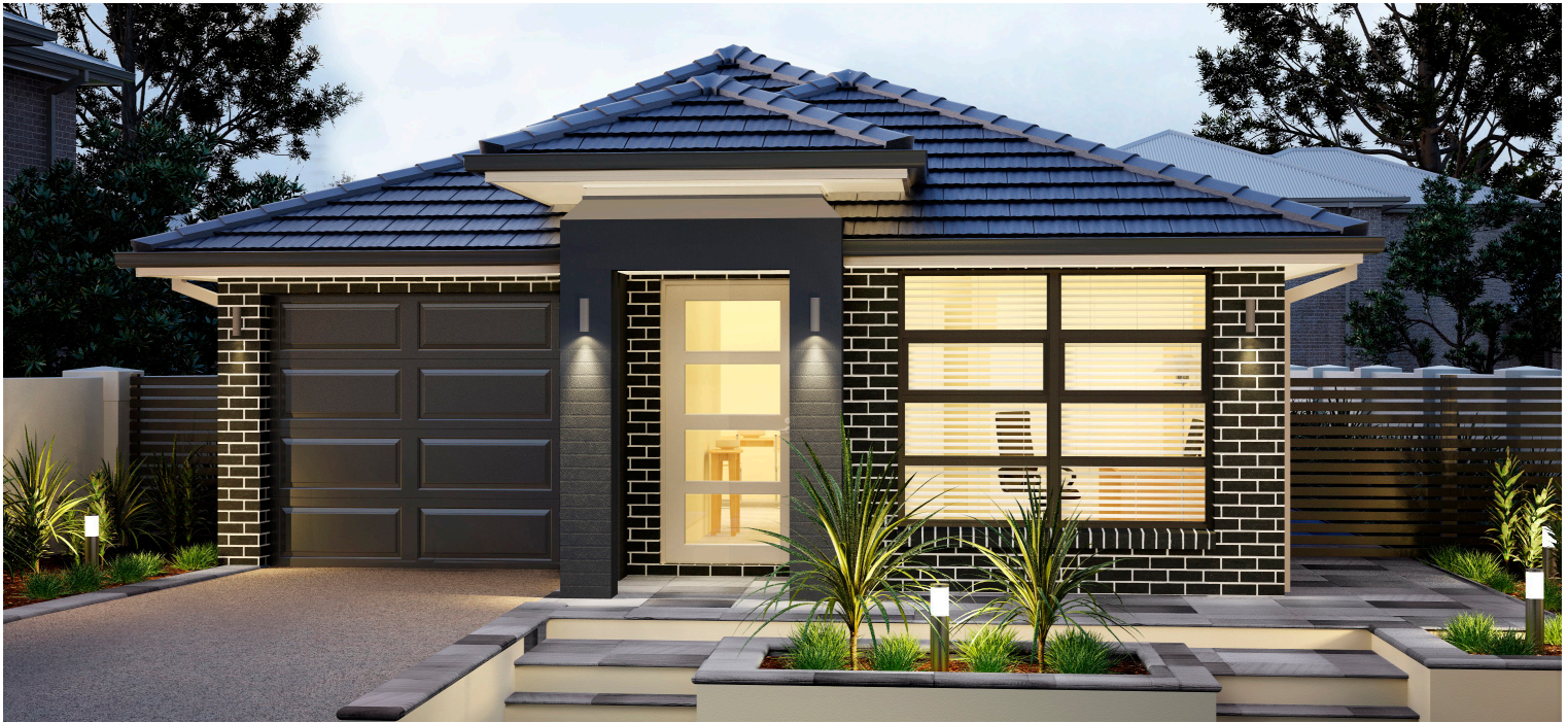
ARTIST IMPRESSION ONLY. ALTA FAÇADE AS ILLUSTRATED.