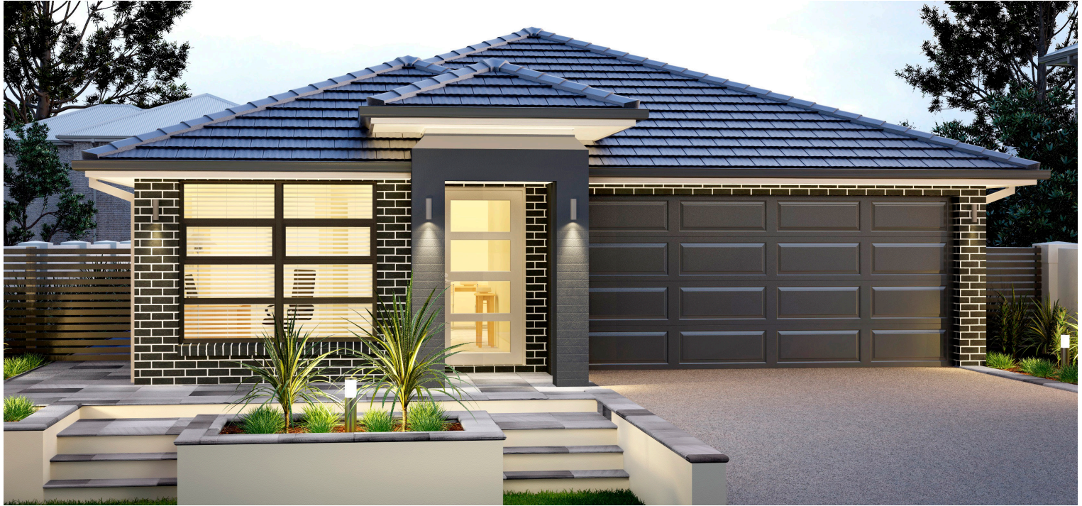
ARTIST IMPRESSION ONLY. ALTA FAÇADE AS ILLUSTRATED.