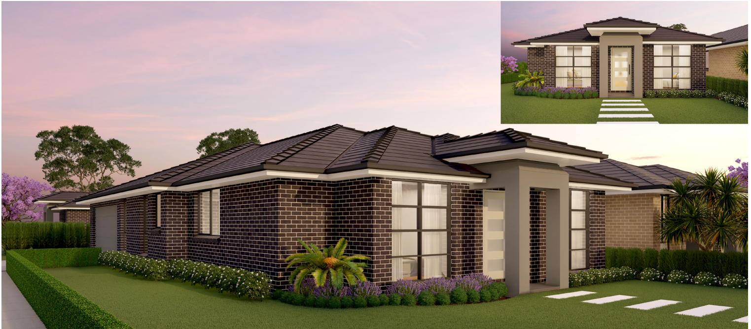
ARTIST IMPRESSION ONLY. ALTA CORNER FAÇADE AS ILLUSTRATED.