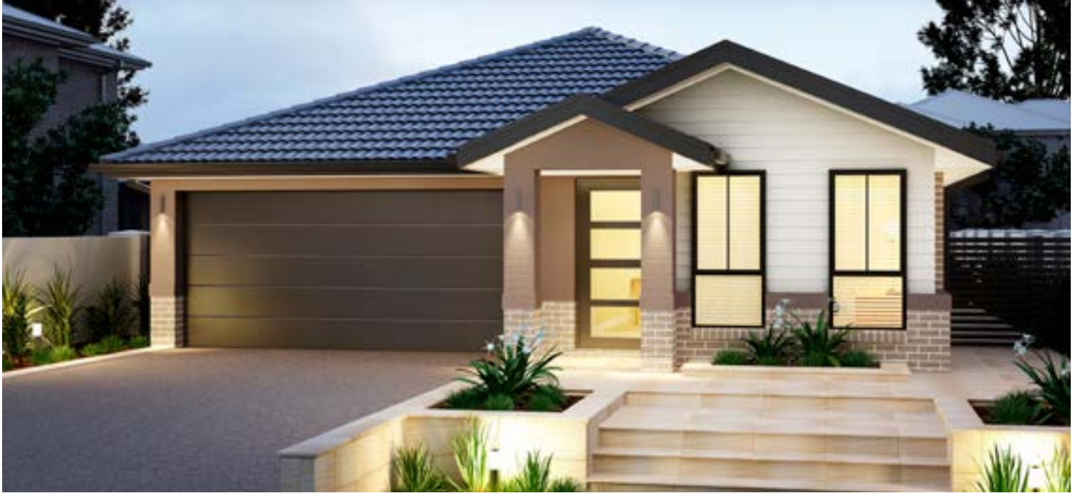
ARTIST IMPRESSION ONLY. TRADITIONAL FAÇADE AS ILLUSTRATED.