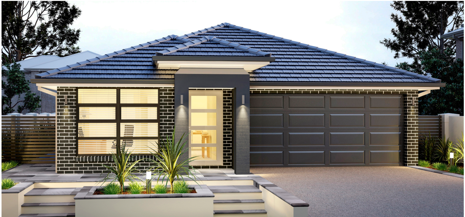
ARTIST IMPRESSION ONLY. ALTA FAÇADE AS ILLUSTRATED.