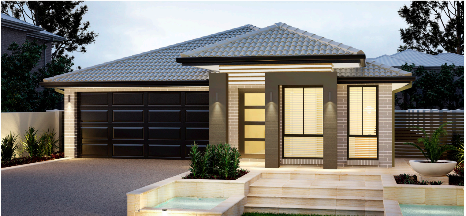
ARTIST IMPRESSION ONLY. STRATTON FAÇADE AS ILLUSTRATED.