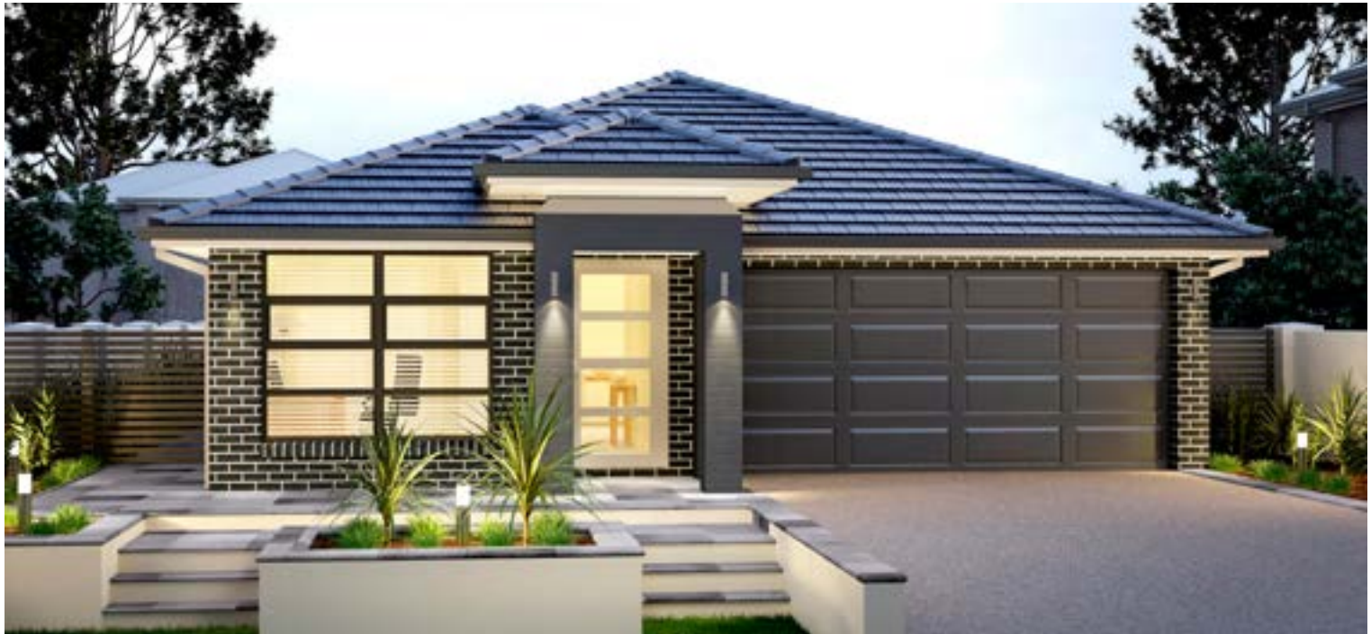
ARTIST IMPRESSION ONLY. ALTA FAÇADE AS ILLUSTRATED.