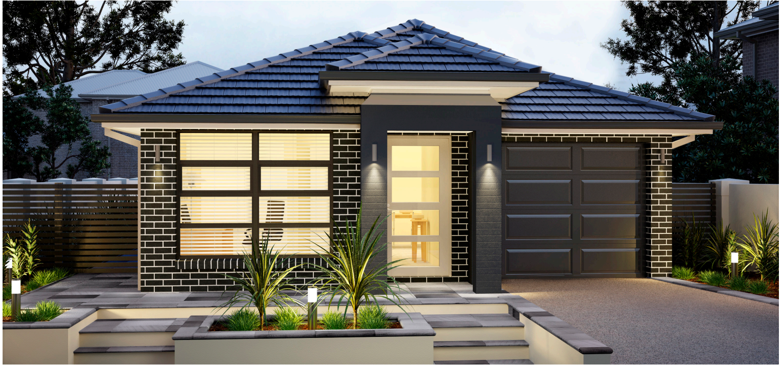
ARTIST IMPRESSION ONLY. ALTA FAÇADE AS ILLUSTRATED.