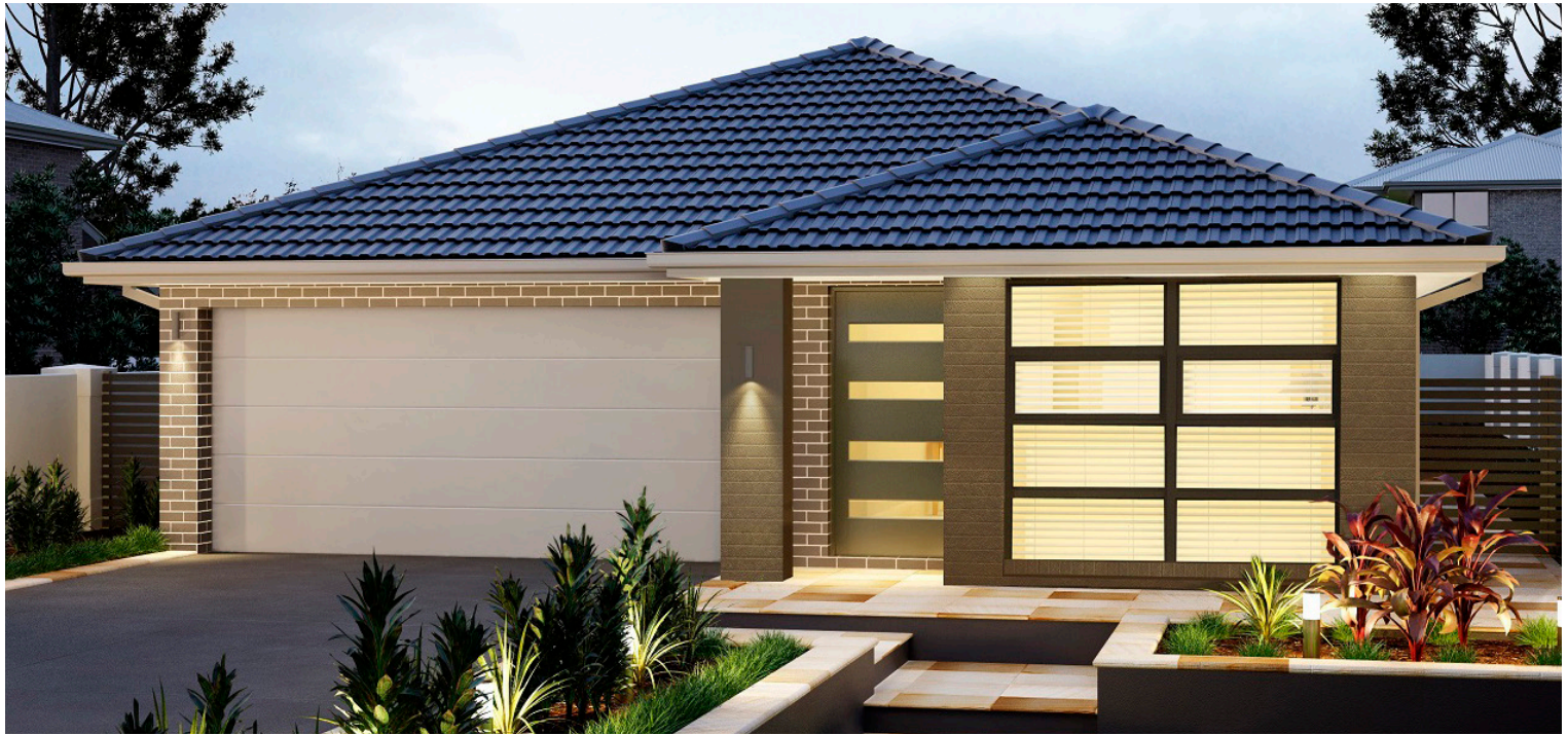
ARTIST IMPRESSION ONLY. DUNE FAÇADE AS ILLUSTRATED.