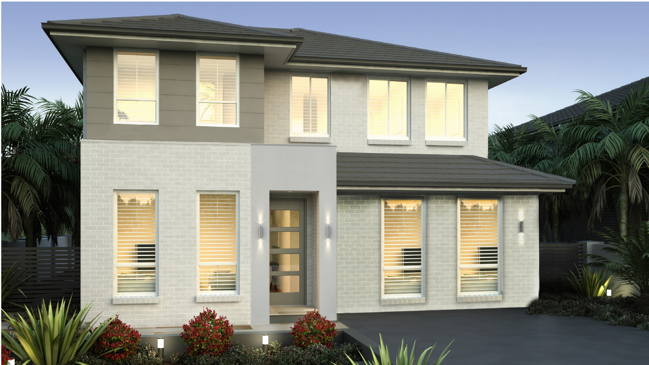
ARTIST IMPRESSION ONLY. TRADITIONAL MK IV MOD FAÇADE AS ILLUSTRATED.