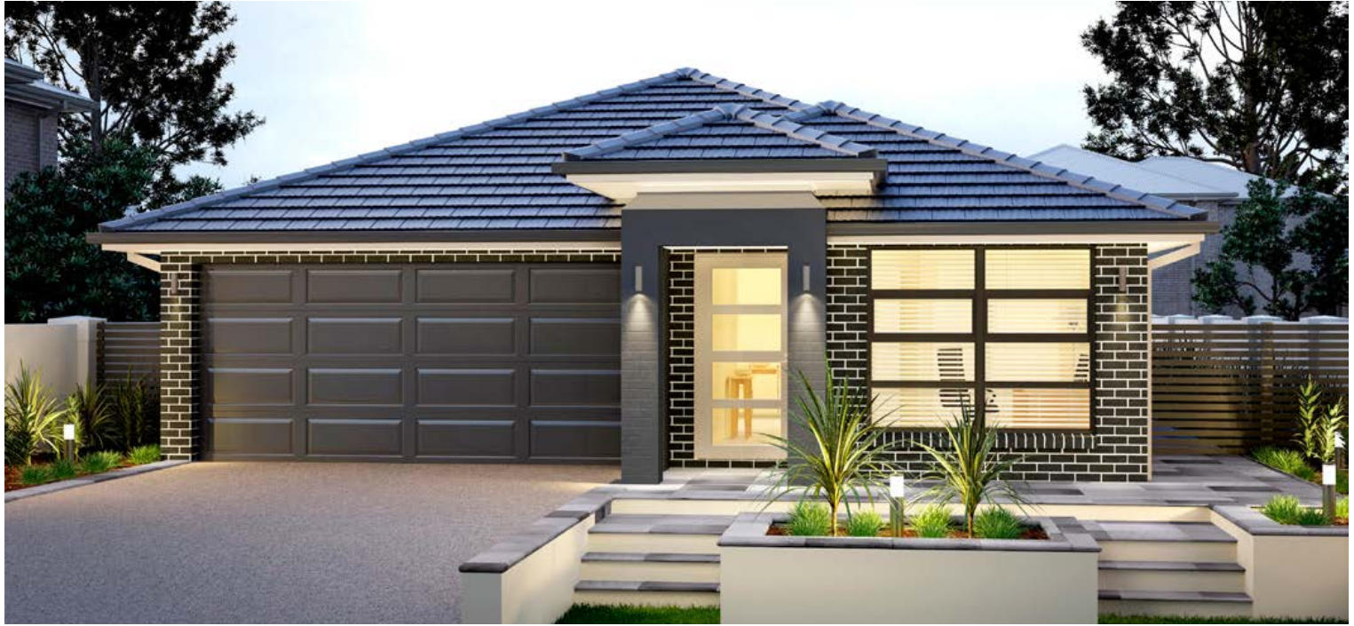
ARTIST IMPRESSION ONLY. ALTA FAÇADE AS ILLUSTRATED.