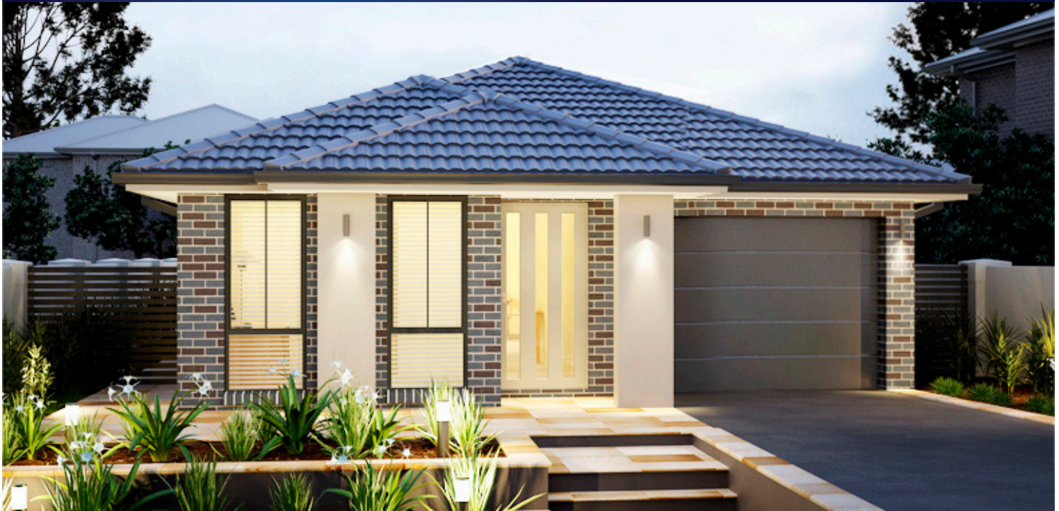
ARTIST IMPRESSION ONLY. ASPEN FAÇADE AS ILLUSTRATED.