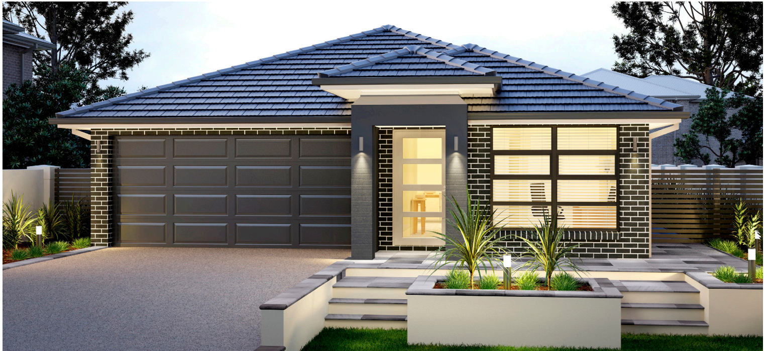
ARTIST IMPRESSION ONLY. ALTA FAÇADE AS ILLUSTRATED.