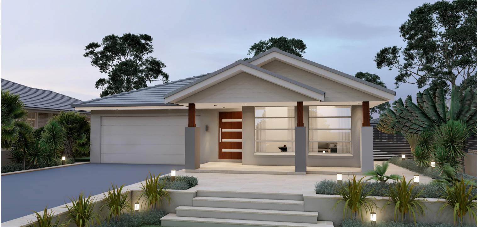
ARTIST IMPRESSION ONLY. MAGNOLIA MKII FAÇADE AS ILLUSTRATED.