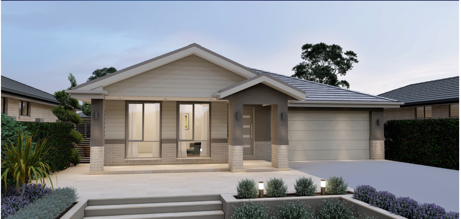
ARTIST IMPRESSION ONLY. NEW TRADITIONAL MKII FAÇADE AS ILLUSTRATED.