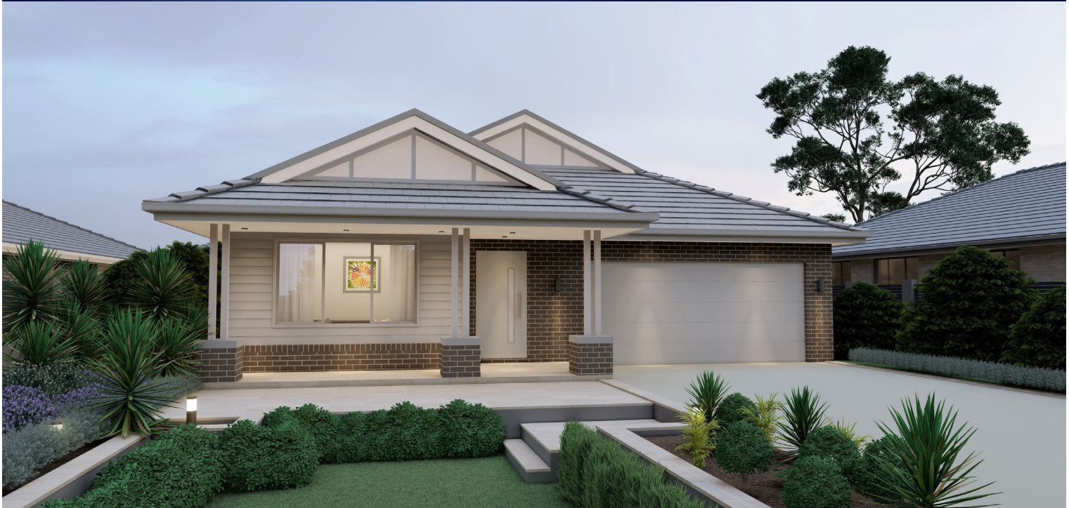
ARTIST IMPRESSION ONLY. MARIGOLD FAÇADE AS ILLUSTRATED.