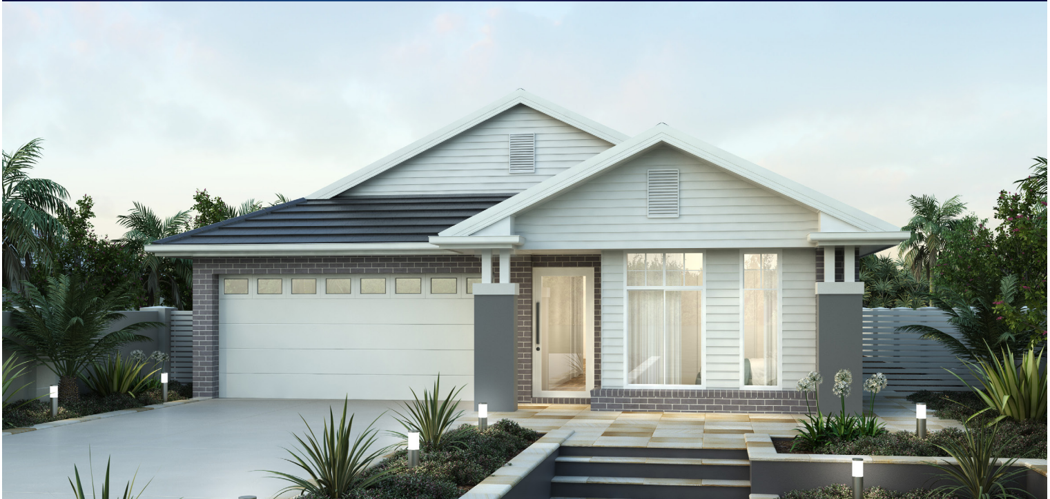
ARTIST IMPRESSION ONLY. BALLINA FAÇADE AS ILLUSTRATED.