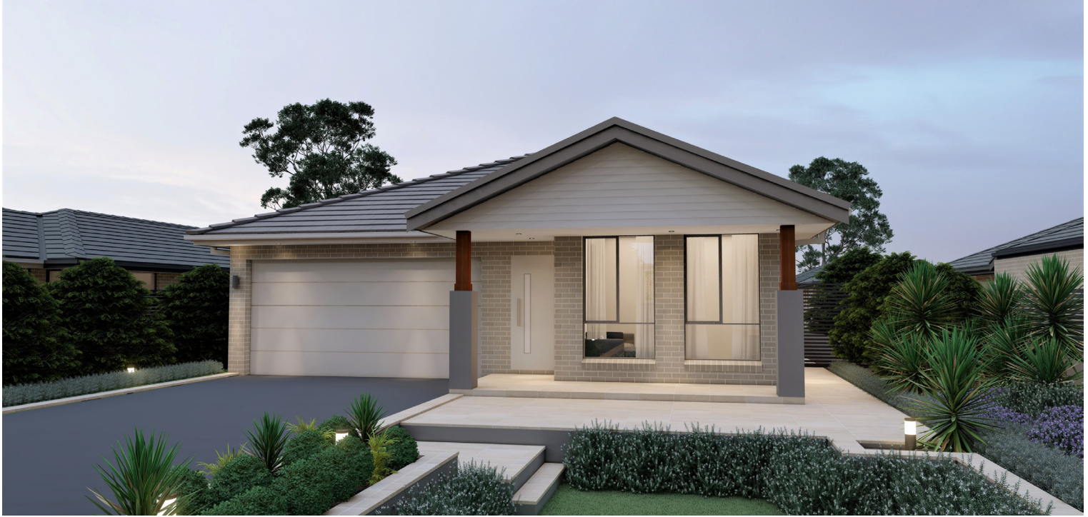
ARTIST IMPRESSION ONLY. TEMORA MKII FAÇADE AS ILLUSTRATED.