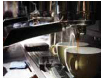
By day, a bustling café and by night an intimate wine bar – Cru exemplifies the new Kew.