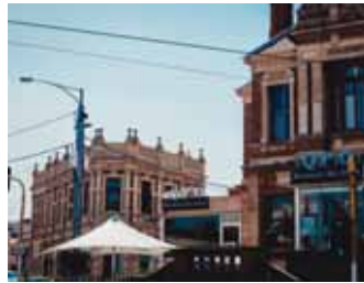
Kew Junction is a vibrant shopping strip and gourmet food hub. This bustling precinct is home to over 600 businesses, from fine dining and artisan bakers to professional and health services.