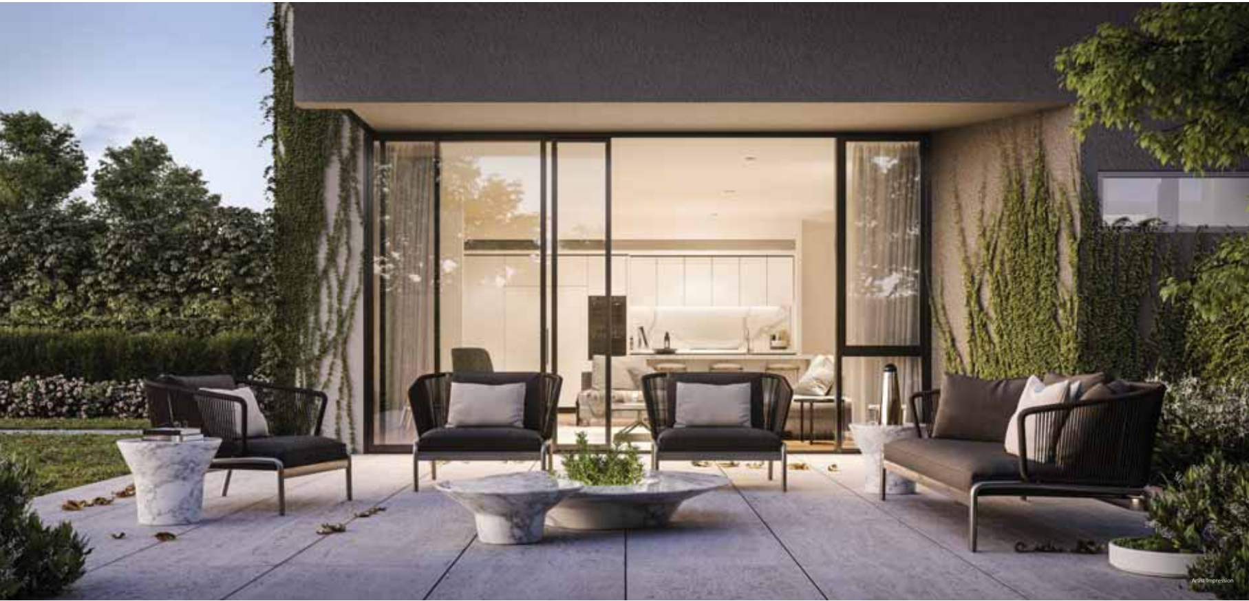
At Eastbridge, the beautiful courtyards conceived by Jack Merlo integrate seamlessly with the indoor spaces. In the warmer months, the gardens are an extension of the light-filled living areas, while in the cooler months the landscape presents a colourful backdrop to the heart of the home.