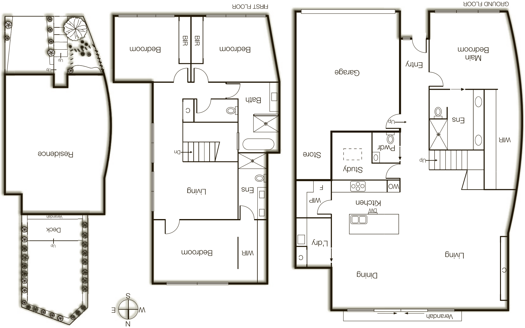
83 Iona Street Black Rock