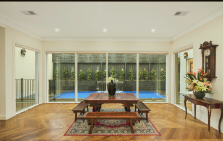
Sophisticated, Glamorous Family Harmony

French Provincial grandeur and luxury unite this 6-bedroom + study, 6-bathroom family residence in a ultra-prestigious location. Sweeping over 3 levels (lift to all floors) features include Calcutta Marble/Gaggenau-appointed kitchen, poolside room. Further enhanced by cinema room, gym, wine cellar, crystal chandeliers, plantation shutters, marble bathrooms, European Oak parquet floors, alarm/security cameras, solar in-ground pool.