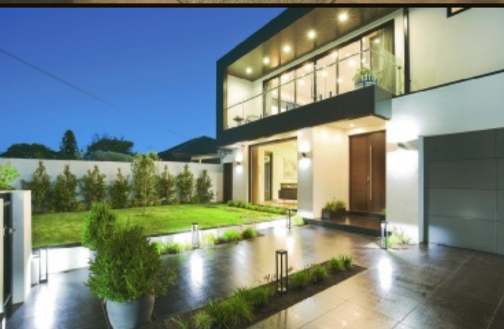
Unprecedented Family Luxury!

Private Sale Contact Simon Wood 0422 789 110