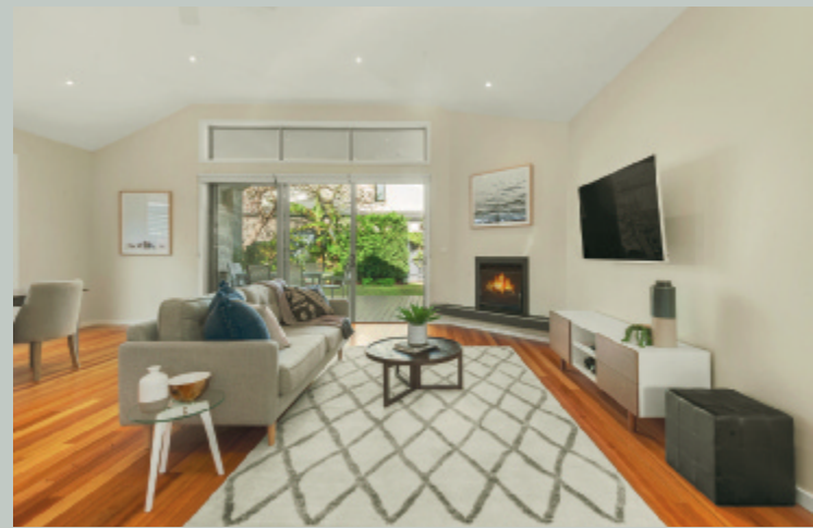
6 Cheltenham Road Black Rock

Courses, College, Bay & Single-Level Style