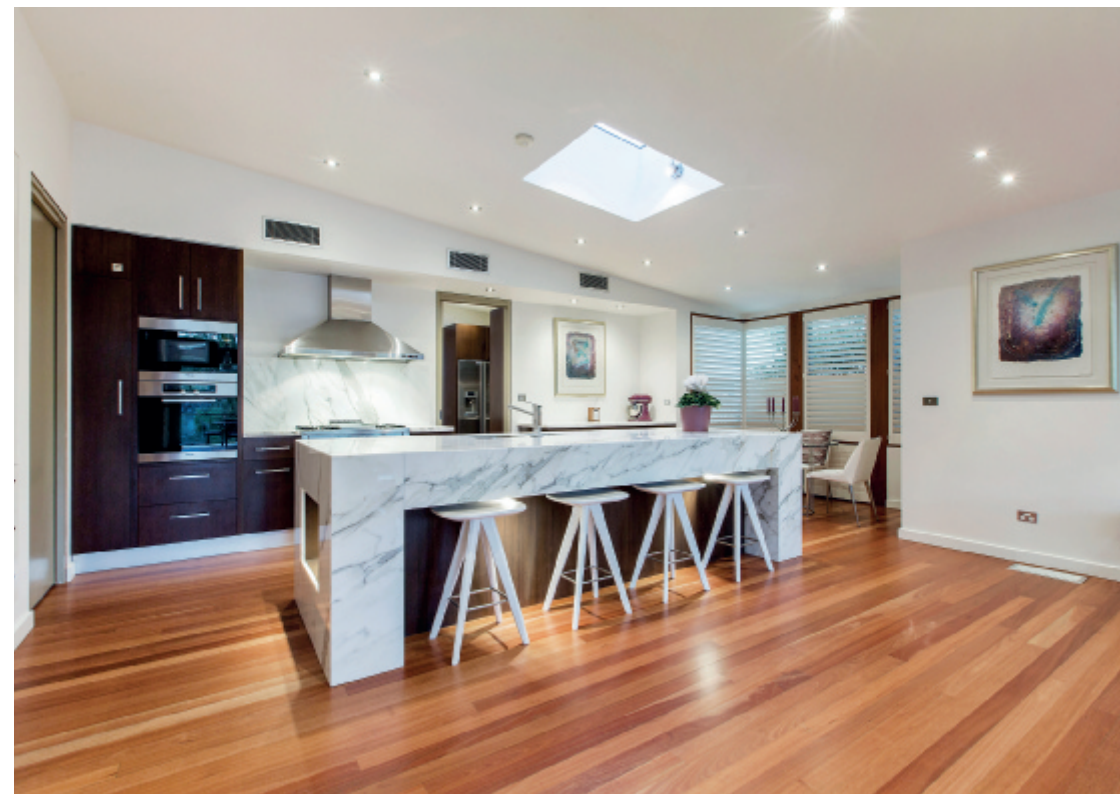
Expansive floor plan spread over cantilevered gallery-like levels delivering leafy vistas and balcony views across the river.