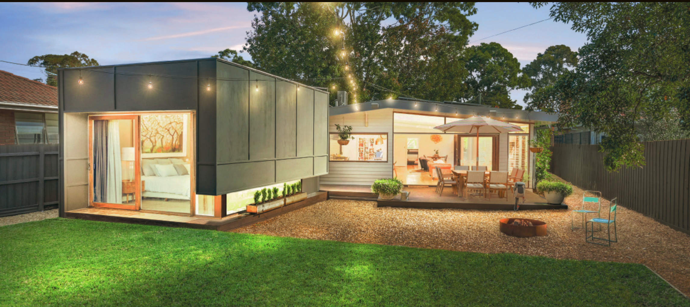
58 Morey Road Beaumaris All-Day Sun, Edgy Architecture & 2 College Zones!