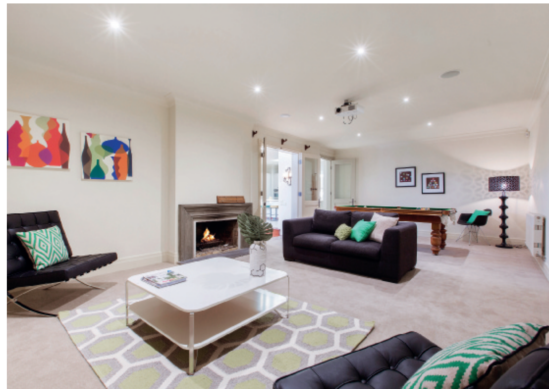
Impressive Sunnyside family residence on magnificent garden allotment at the pinnacle of today's family expectations.