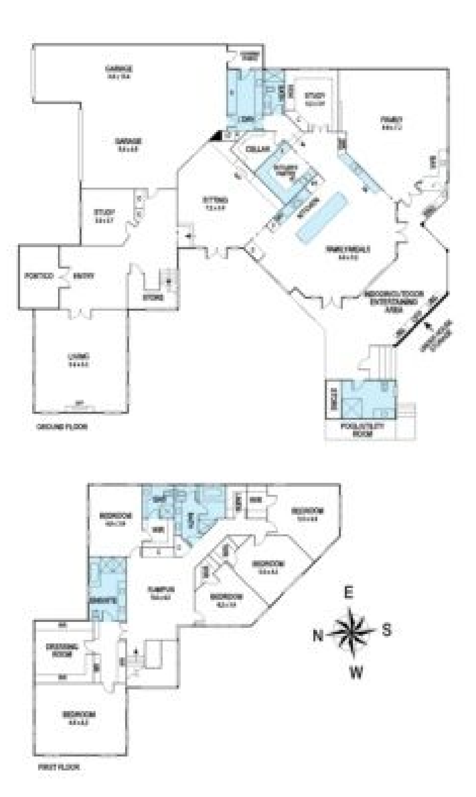
Disclaimer The measurements provided of the land and/or property may not be 100% accurate. In order to satisfy yourself of the exact dimensions of the property/land/or of each room, we advise you to conduct your own measurements and/or engage the services of a licensed surveyor. Responsibility for any omissions or errors contained herein is expressly denied. Jellis Craig (Mount Waverley) and Company Pty Ltd Licensed Estate Agents, Auctioneers and Property Managers.