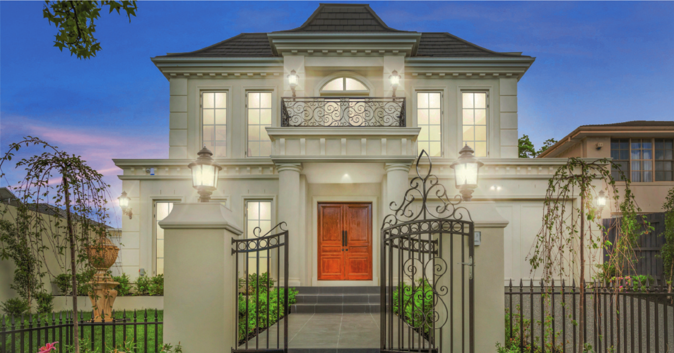
5 Illawarra Road Balwyn North Prestigious, Stately and Spectacular