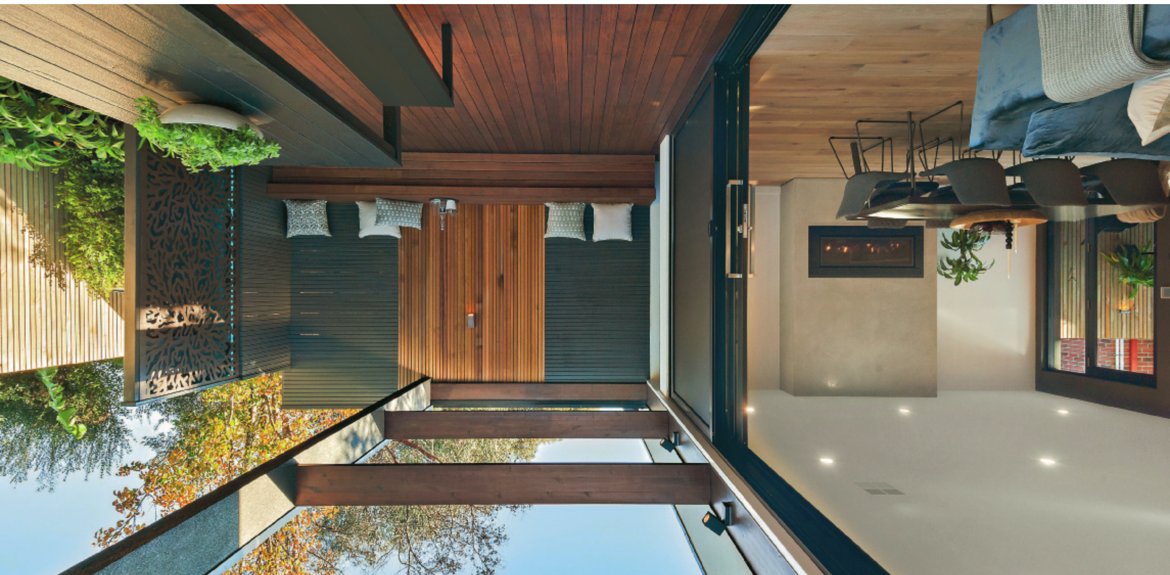
4b Mariemont Avenue Beaumaris