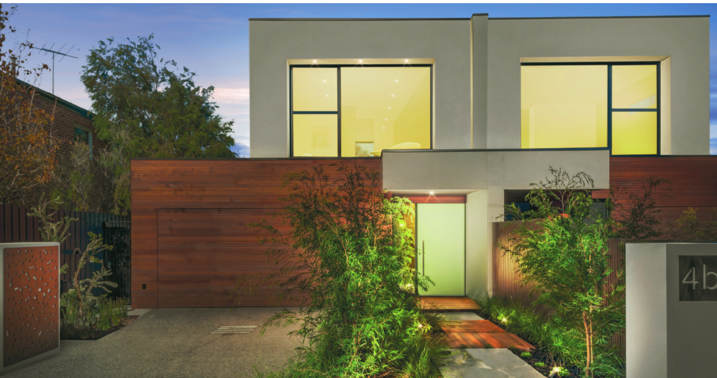
4b Mariemont Avenue Beaumaris Benchmark Quality at a Prestige Location