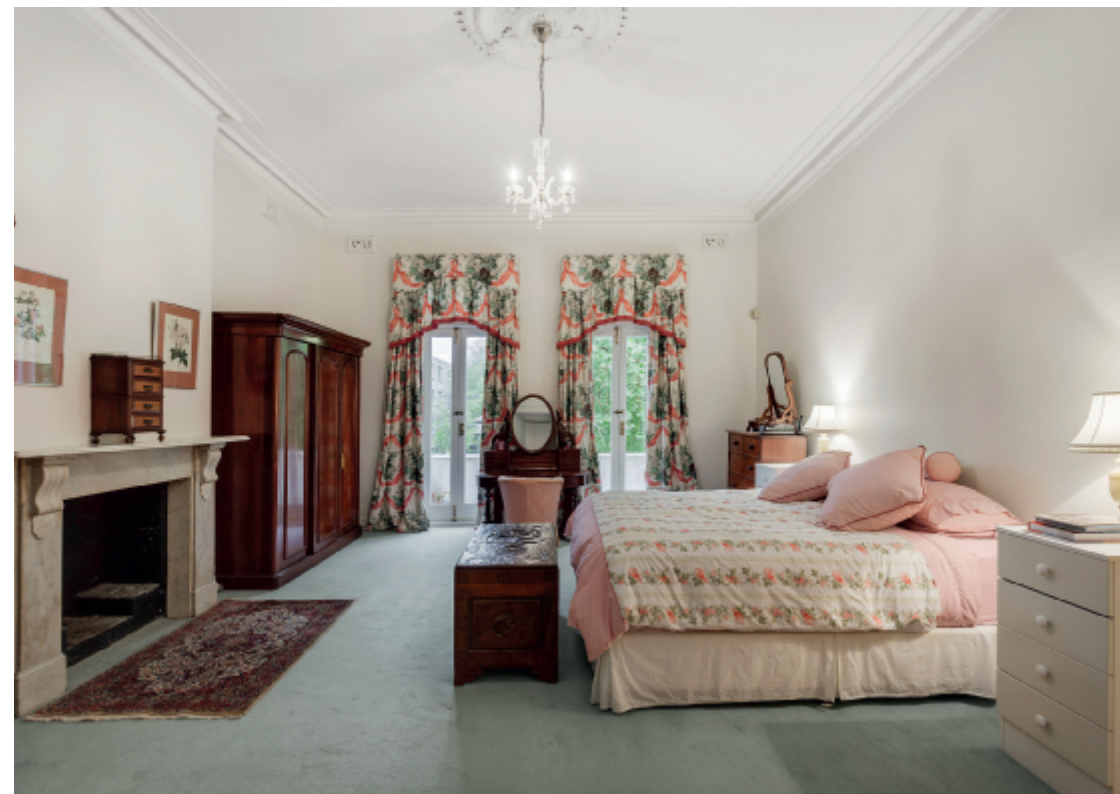
"Ilfracombe" - a landmark c1880's Victorian residence.