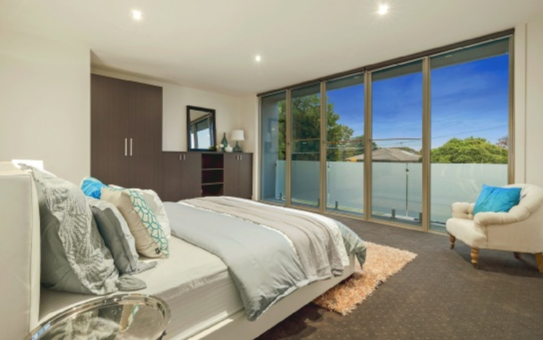
Exceptional Living, Exclusive Locale