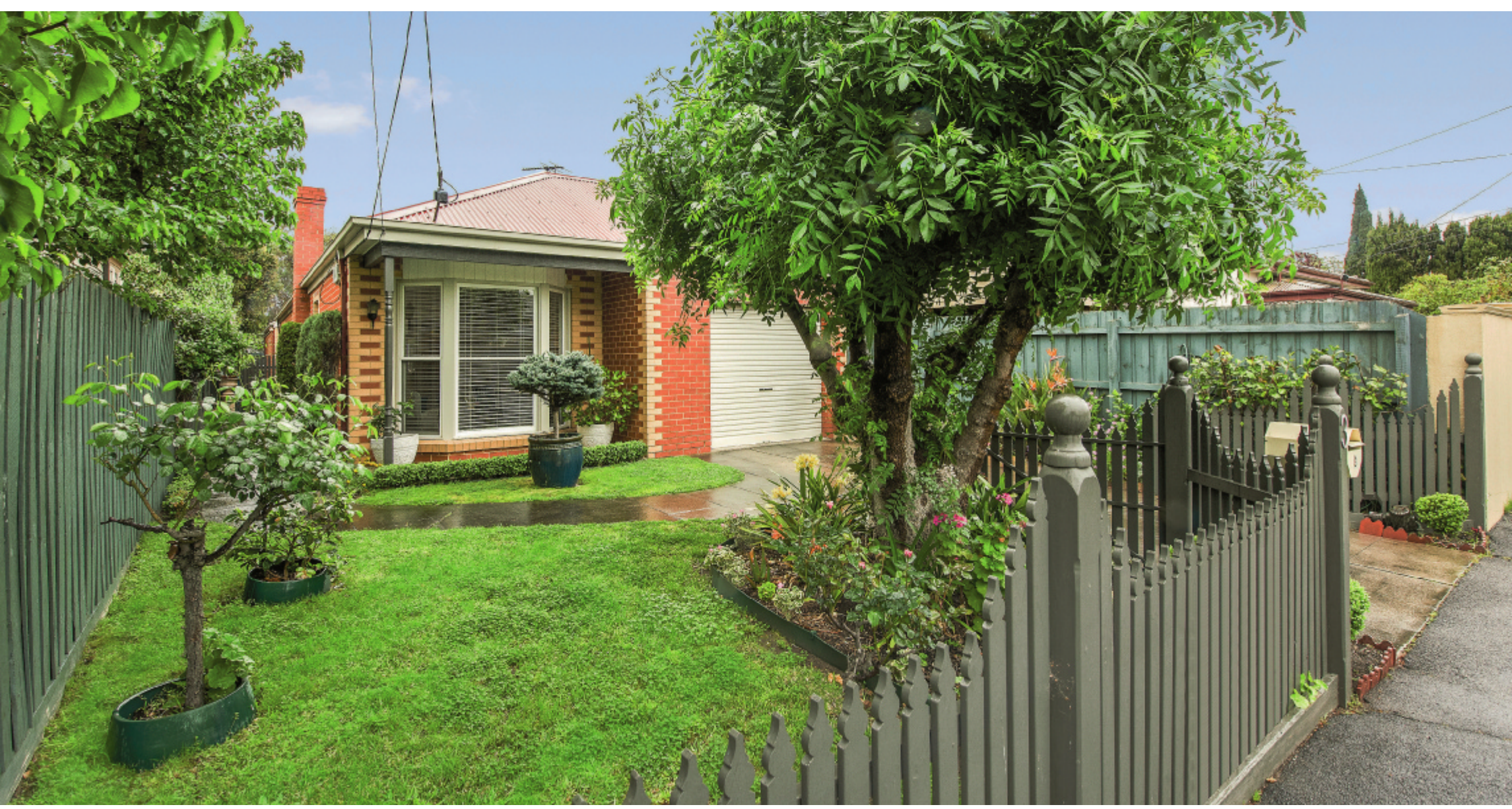
3 Parliament Street Brighton Single level ease in a blue ribbon locale