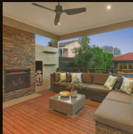
"Kuliang" c1916 - a beautiful Edwardian delivering grace & elegance with a prized beachside address