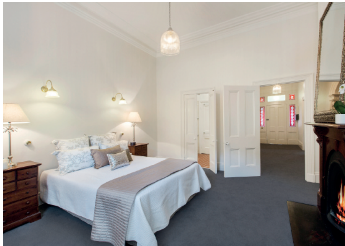
Elegant Victorian 4-bedroom family residence with classic features on magnificent garden allotment in prestigious location.