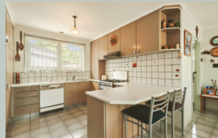
23 Middleton Street Highett Family Comfort & a First Class Location