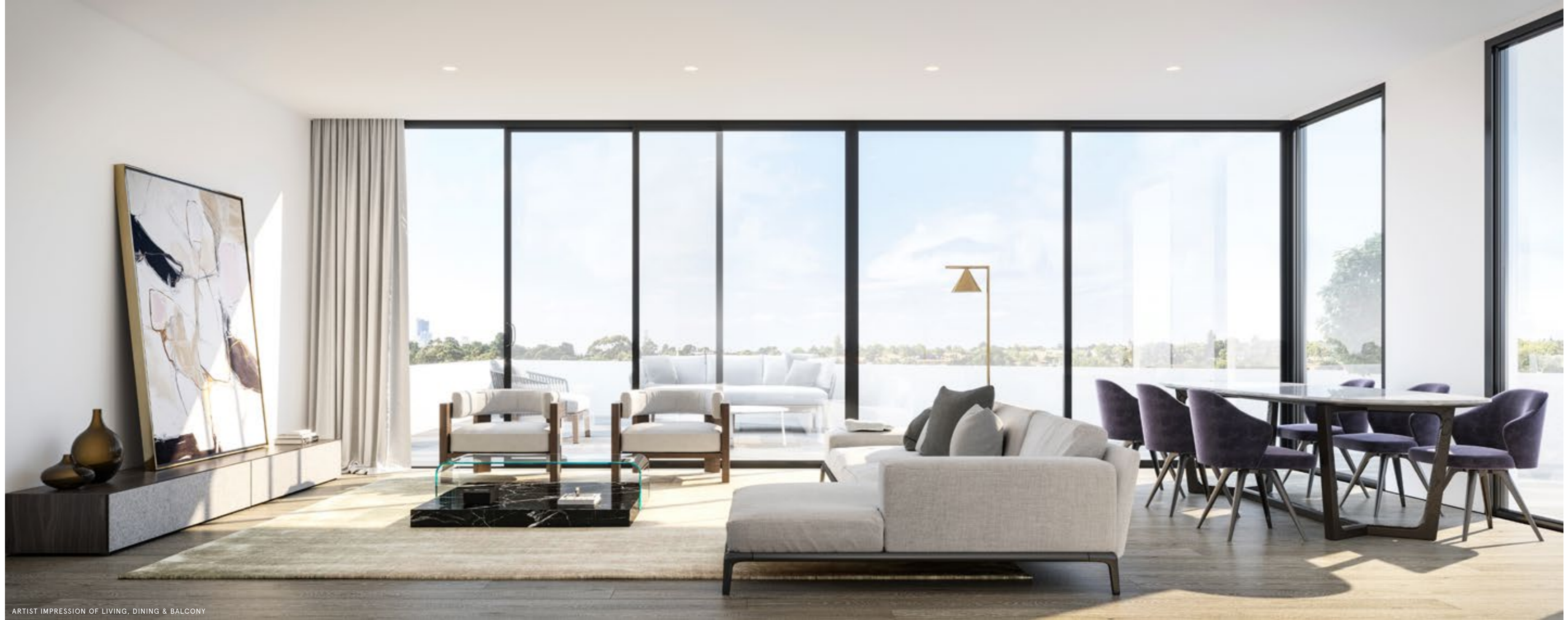
ARTIST IMPRESSION OF LIVING, DINING & BALCONY

..... There is a sense of boundlessness to Royal Ascot's living areas, which cleverly blur traditional perimeters by combining internal and external living spaces, allowing occupants to roam through their home seamlessly. Floor-to-ceiling windows frame some of the city's most iconic views while illuminating a palette of neutral and warm interiors, founded on linear design.