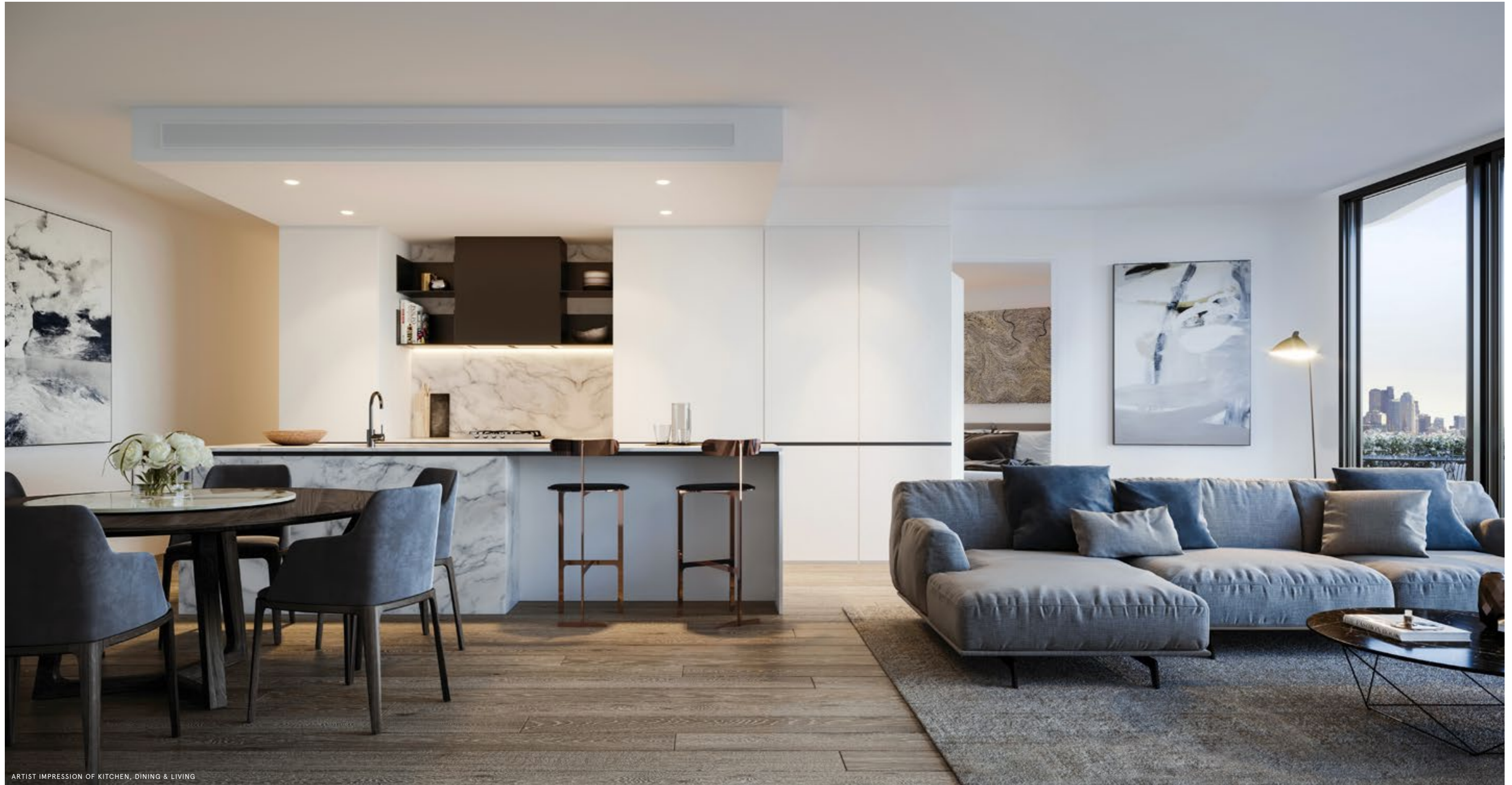
ARTIST IMPRESSION OF KITCHEN, DINING & LIVING

Kitchens envisioned by industry leader Mim Design are considered to the highest degree – not only designed as cohesive, functional and revitalising settings, but to inspire and unleash the chef within.