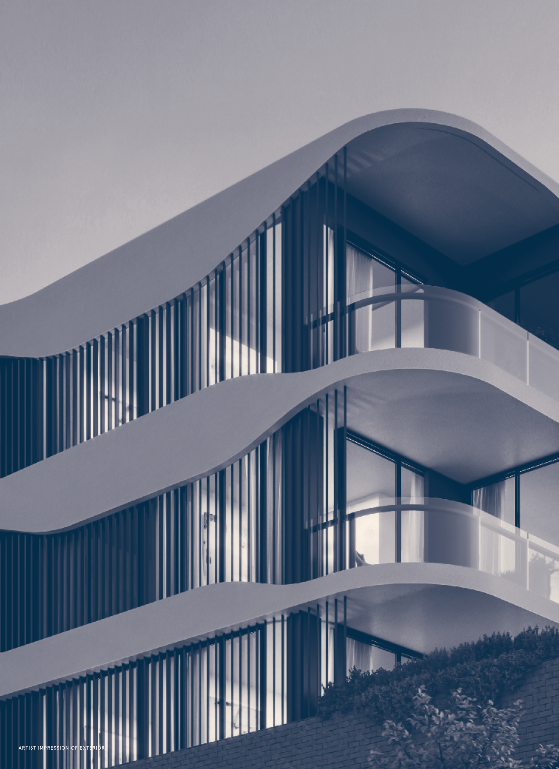
ARTIST IMPRESSION OF EXTERIOR