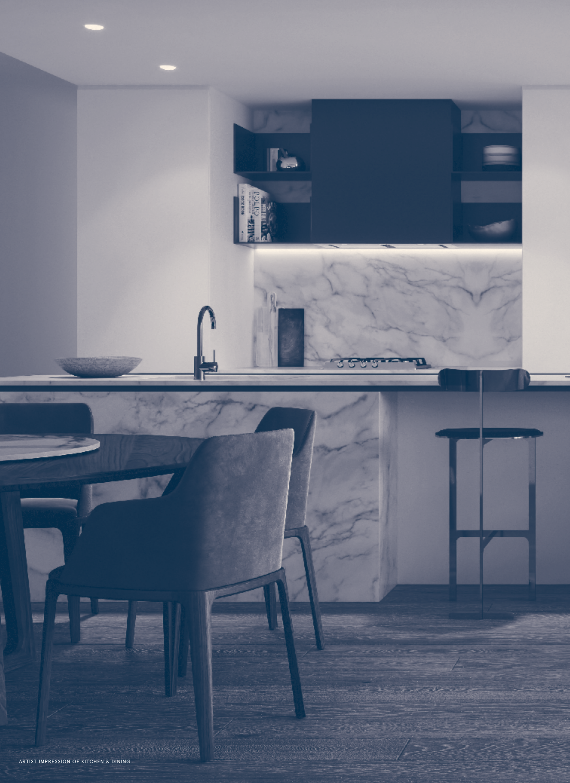
ARTIST IMPRESSION OF KITCHEN & DINING