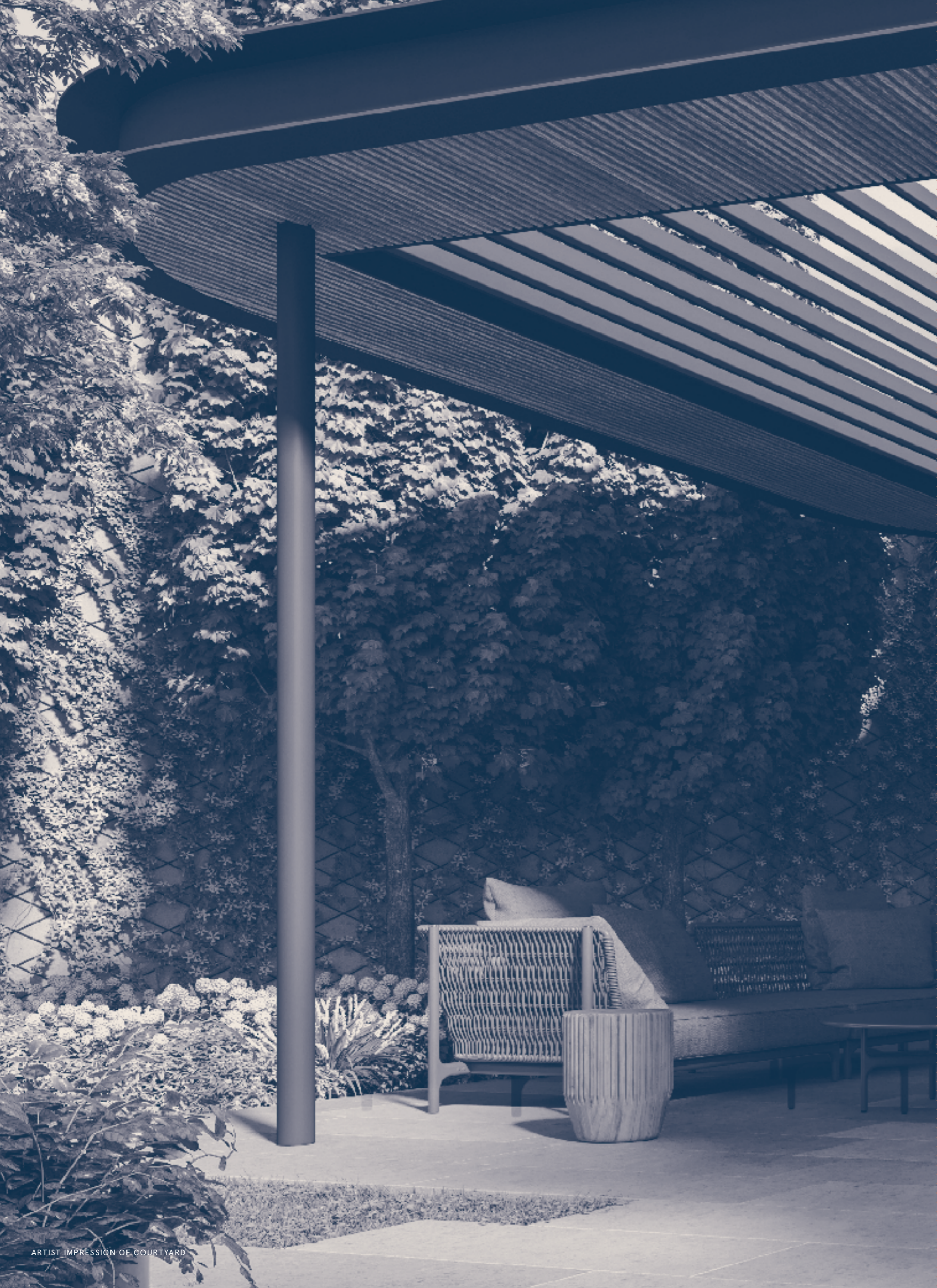
ARTIST IMPRESSION OF COURTYARD