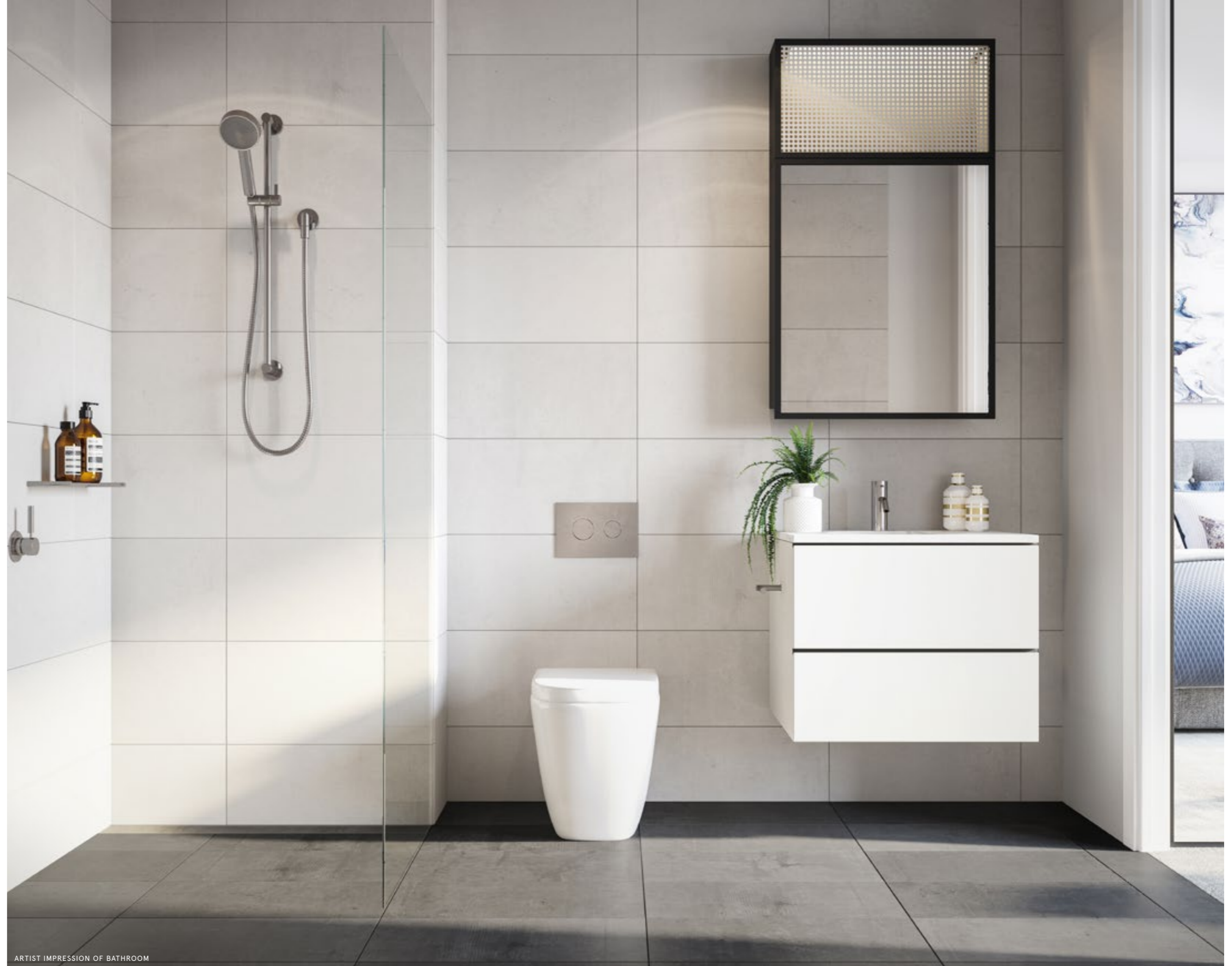
ARTIST IMPRESSION OF BATHROOM

Minimal with a strong penchant toward clean linearity, bathrooms are founded on high quality finishes, fixtures and fittings. Rewarding simple, sensual pleasures, these materials are selected just as much for their tangible qualities as their visual appeal.