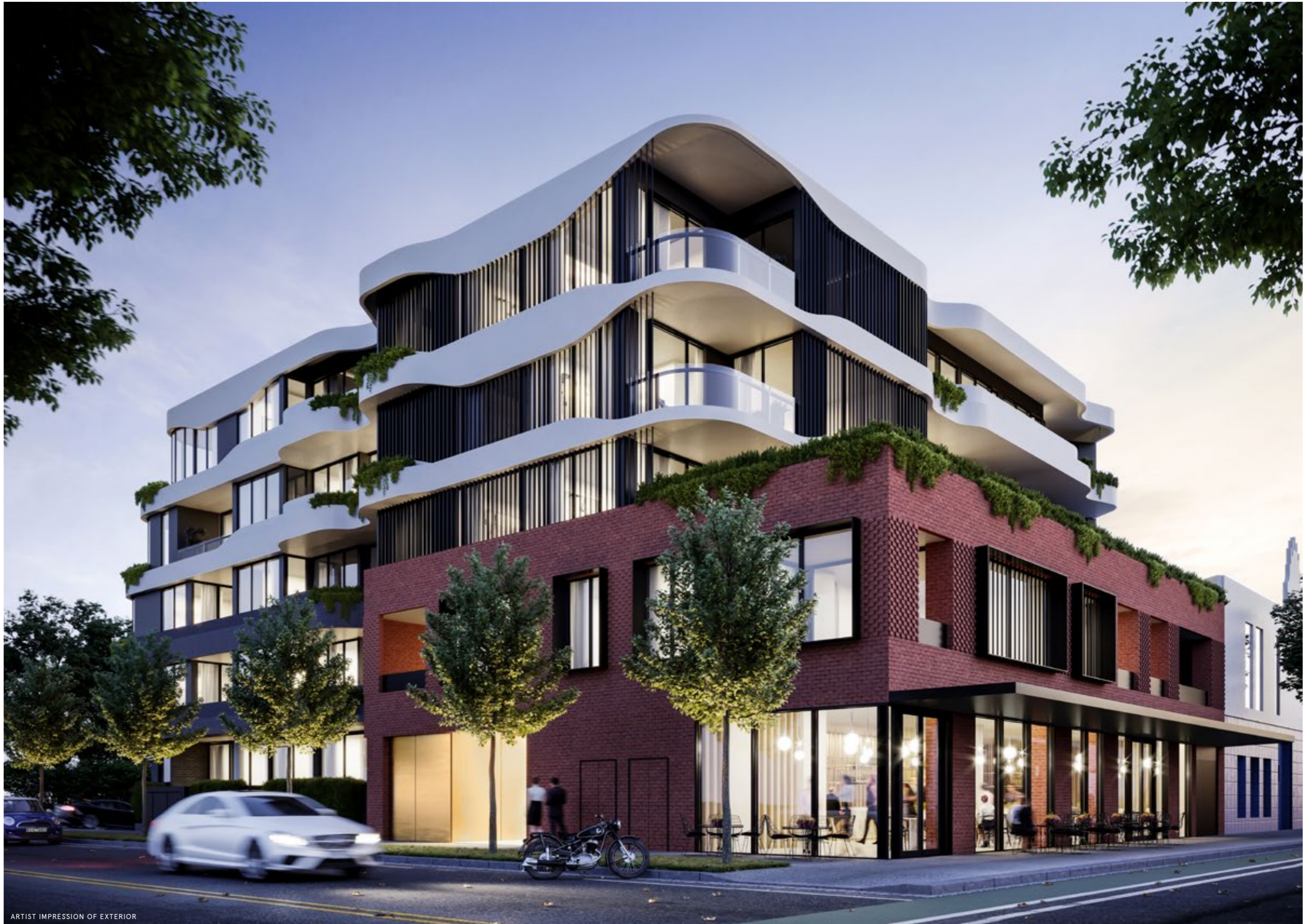
ARTIST IMPRESSION OF EXTERIOR

Full of character, an artistic, sweeping facade both respects and compliments Ascot Vale's rich surroundings. Beyond it lies a refined series of homes built for a life of full of luxurious and vibrant moments. Welcome to Royal Ascot.