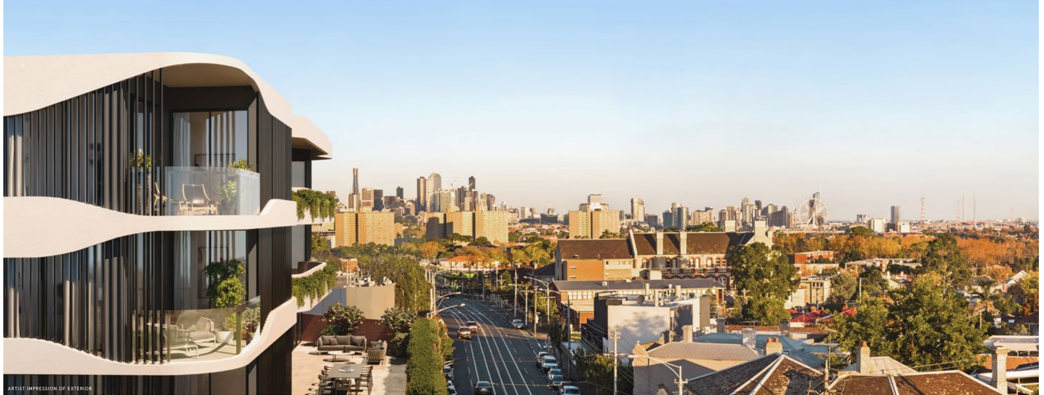
ARTIST IMPRESSION OF EXTERIOR

Royal Ascot's balconies feature lush planter boxes, cleverly bringing the idea of a suburban garden up into the sky. Advantageously perched on a corner site, the sophisticated exterior reflects what is found within. Natural light is allowed into the homes through grand windows that simultaneously give way to spectacular views of the city skyline.