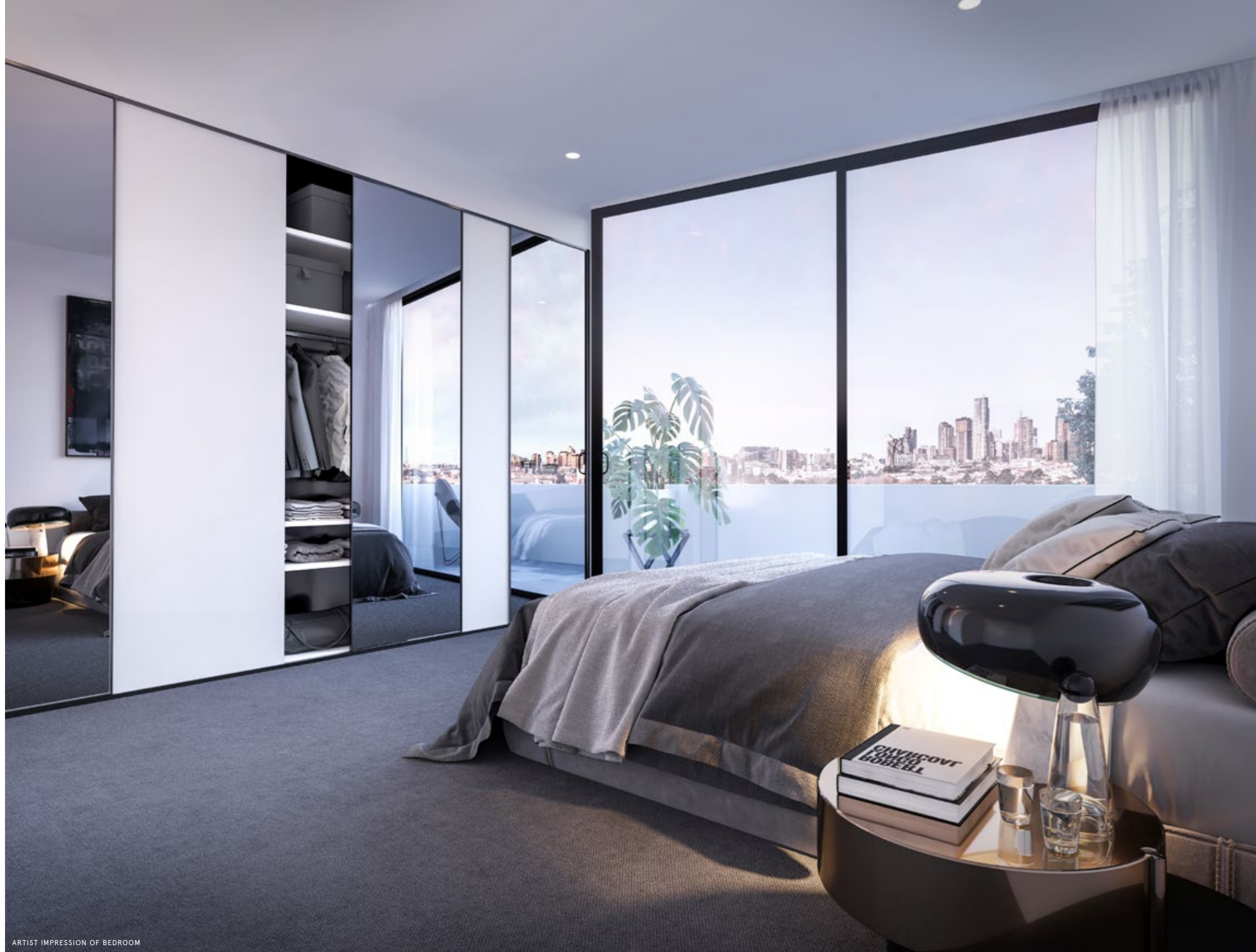
ARTIST IMPRESSION OF BEDROOM

Elegant sleeping areas integrate large wardrobes, a study nook, 100% wool carpets and ensuites in the master bedroom, highlighted by ample natural light that travels through generous windows.