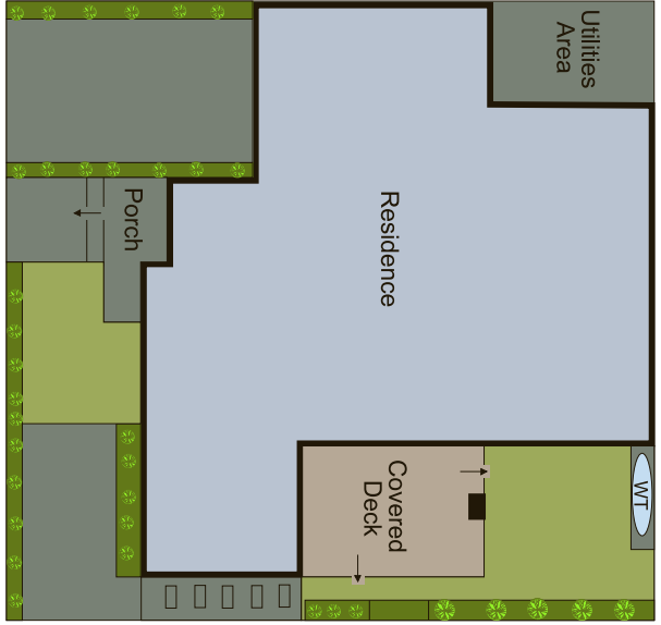
1c Middleton Street Highett