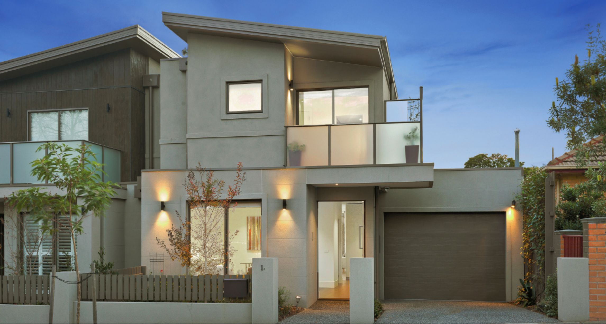
1A Tuxen Court Brighton East Exceptional Dendy Park Luxury