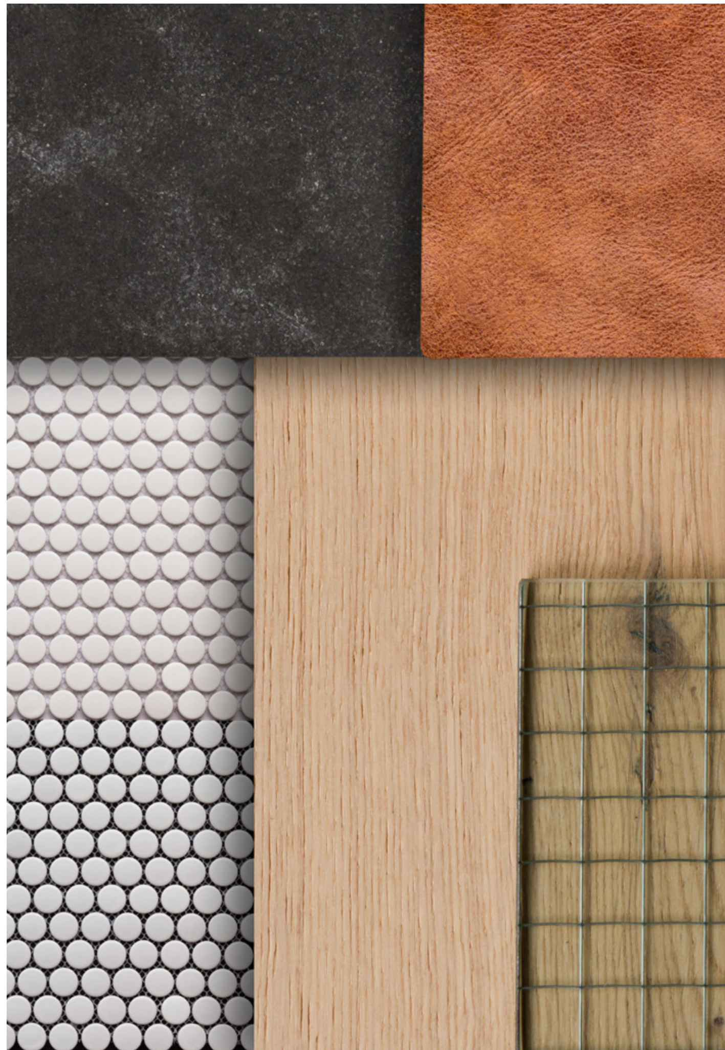
The eclectic robust palette celebrates an industrial aesthetic reimagined for modern living.