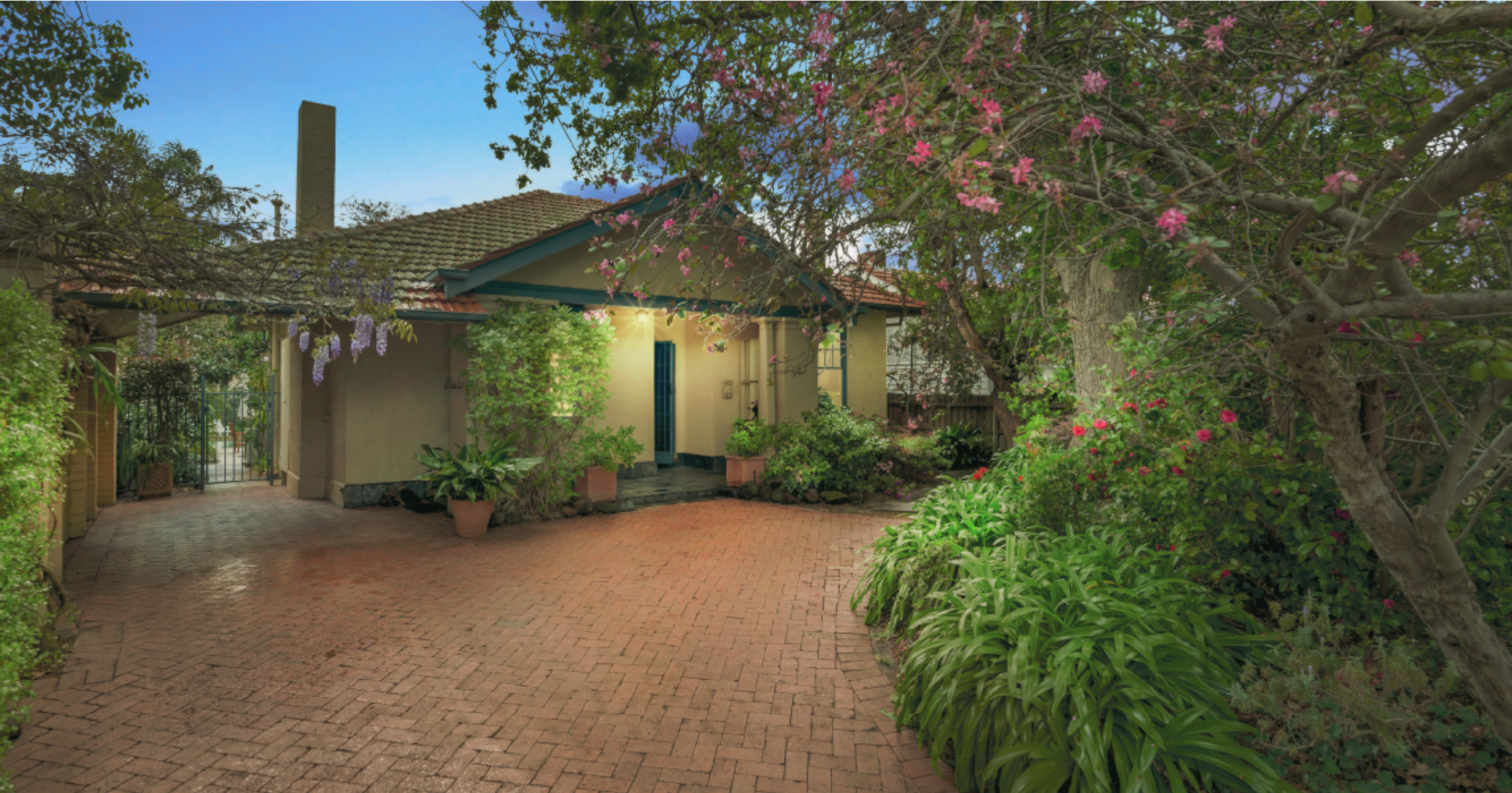
18 McLauchlin Avenue Sandringham Period Beauty with a Sun-Bathed Pool Focus